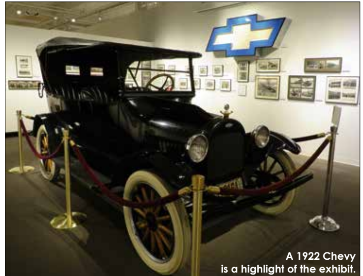
A 1922 Chevy is a highlight of the exhibit.

Knoepfler Chevrolet traces its lineage back to Ryal Miller Chevrolet Company, which started its Sioux City dealership in May 1922.