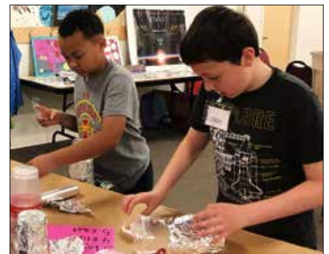
"Space Cities" includes hands-on activities.

camp equipment, uniforms, and firearms like those used during the Lewis and Clark expedition. Families are invited to explore an 1804 living-history camp replicating the expedition's stay in present-day Sioux City. Long-time re-enactors interact with visitors to bring history to life. Children's activities will be available from 10 am to 1 pm on Saturday.