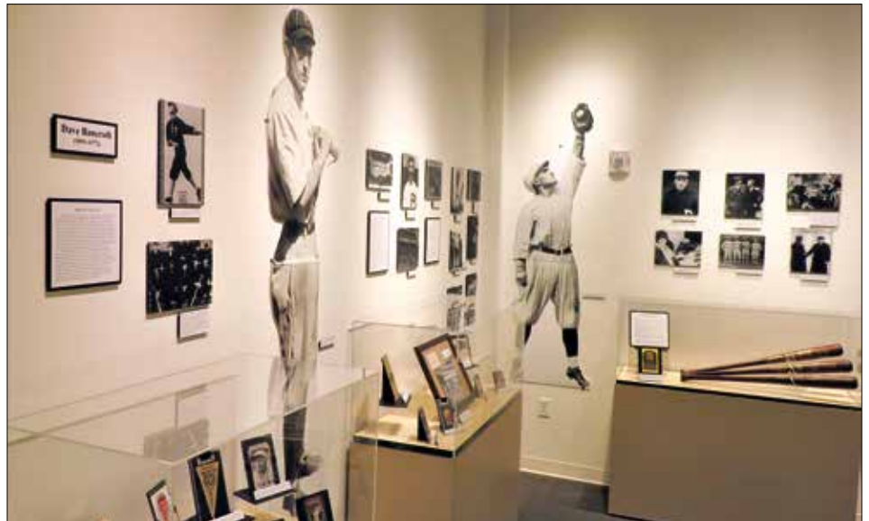
The display showcased Dave Bancroft's baseball cards, a bat from the National Baseball Hall of Fame, and photographs from throughout his career.

Later that evening, the Sioux City Explorers dedicate the Dave Bancroft Pavilion featuring a new plaque honoring the city's premier short-stop. The pavilion is located behind the new Explorer's business office.