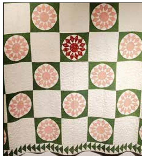
A patchwork pattern quilt featured in the exhibit.

The quilts, dating from the 1840s to the 1940s, feature styles such as North Carolina Lilly, Dresden Plate, Friendship, Six-Point Star, Princess Plume, Patchwork, Patriotic, Log Cabin, Flower Basket, Postage Stamp, and Crazy Quilt.