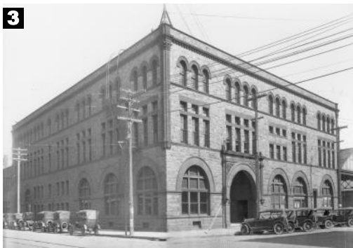
Southeast corner of 3 rd and Douglas

Founded in 1878, the Palmer Candy Company is one of Sioux City's oldest companies. When this structure was built in 1899, the company was considered to be one of Iowa's leading candy making companies. Not only is it one of the country's oldest candy companies, it also has the longest span of family ownership and management of any candy company of its size in the United States. It was razed to make room for the Stoney Creek Inn.