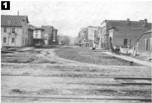
Looking north from Second Street

Start at Second Street and Douglas Street walking north to 7 th Street.