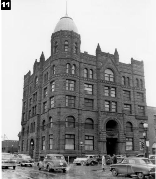
Northwest corner of 6th and Douglas

This was the Federal Building and Post Office from 1895 until 1933 when a new Federal building was constructed across the street. In 1948 the building became City Hall. Although the City Hall today looks very similar to this photograph, the City Hall was completely rebuilt in the 1990s using the stones from the original building.