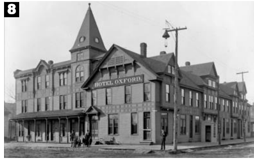
Southwest corner 6 th and Douglas