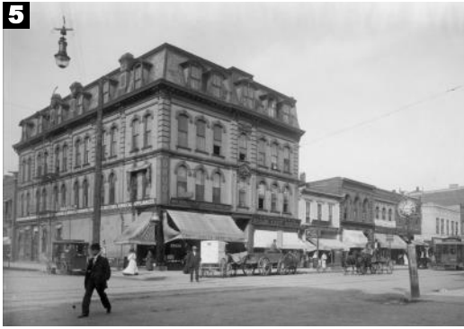
Northeast corner of 4 th and Douglas