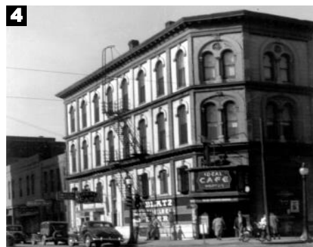
Southwest corner of 4 th and Douglas

Buildings listed in italics are no longer in existence.