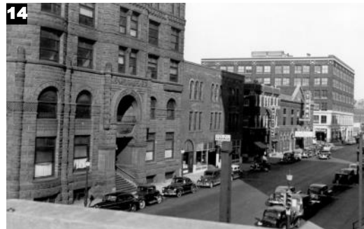
Douglas between 6th and 7th Streets