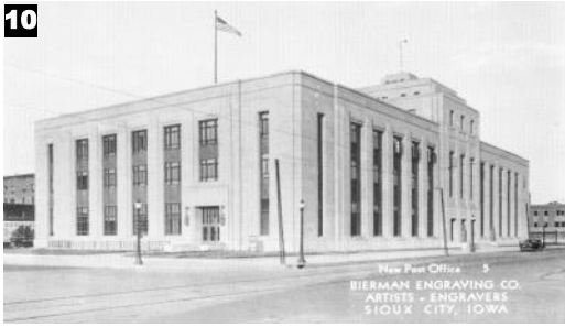
Southwest corner of 6th and Douglas