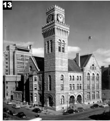
Northeast corner of 6th and Douglas

Built in 1933 as the Post Office and Federal Building, the Post Office moved out in 1983.