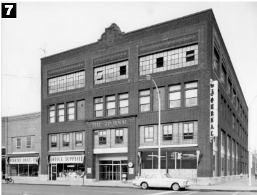
Southwest corner of 5 th and Douglas