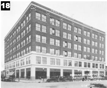
Northwest corner of 7 th and Douglas