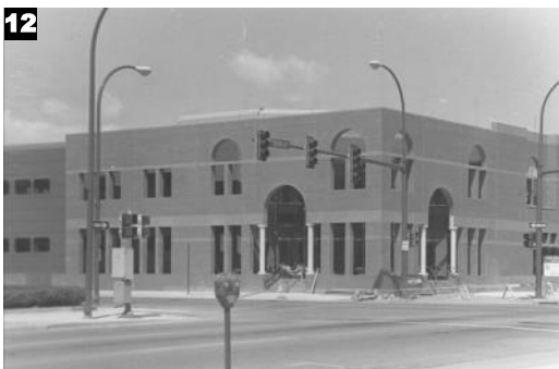
Northwest corner of 6th and Douglas

This photograph looking north from the old City Hall (left) to the Warnock Building (now called the Benson Building) was taken around 1940. The traffic on Douglas Street went two ways at the time.