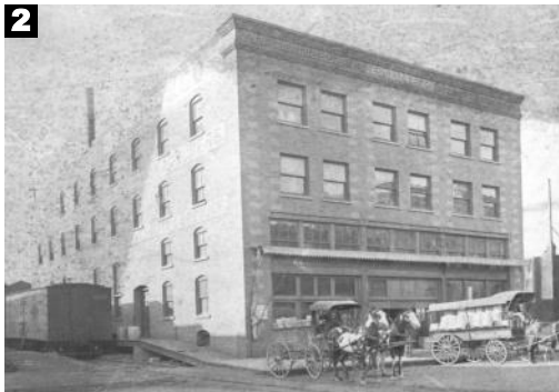
Westside of Douglas between 2 nd and 3 rd Streets

Along with Pearl Street, Douglas Street was one of Sioux City's main business streets in the city's first quarter century. There were blacksmith shops, banks, grocers, and hotels along Douglas Street in the 1870s when this photo was taken.