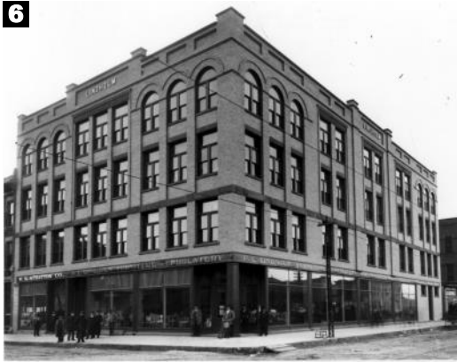
Southwest corner 5 th and Douglas

The Hedges Block housed the Ruff Drug Store along with other businesses. In June 1918, the building collapsed while under renovation and burned. With 39 deaths and more than 70 people injured, the “Ruff Disaster” is still considered to be one of Sioux City’s worst tragedies.