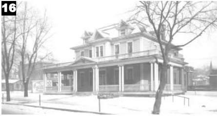
Southeast corner of 7 th and Douglas