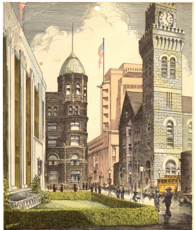
Sixth and Douglas, 1940s