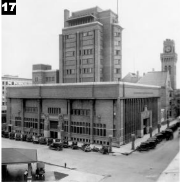
Southeast corner of 7 th and Douglas