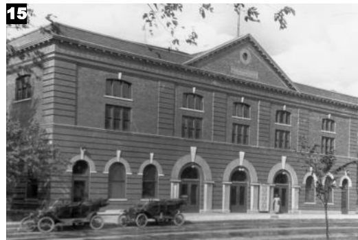
Southwest corner of 7th and Douglas

Before the Police and Fire Headquarters moved to this site in 1986, the departments were housed in a building at the southwest corner of 6th and Water.